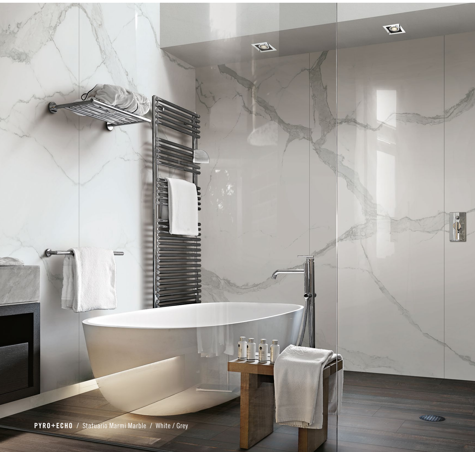
PYRO+ECHO / Statuario Marmi Marble / White / Grey