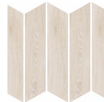
110 x 540 T2038