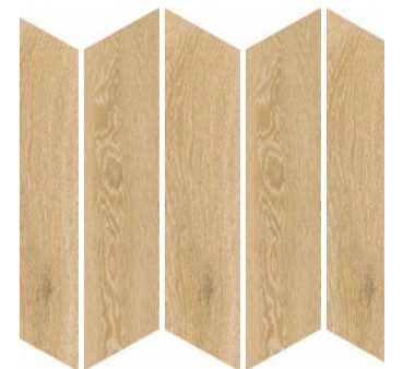
110 x 540 T2039