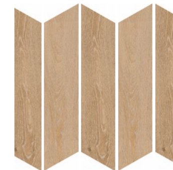
110 x 540 T2040