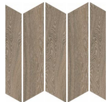
110 x 540 T2041